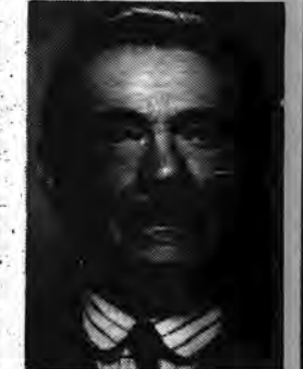
CLIFTON WEBB the star in the "Remarkable Mr. Pennyacker" showing at Sicuras Cove Theatre, Glen Cove, now thru Saturday, Mar. 21.