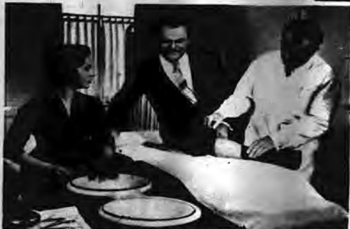
JAMES CAGNEY has rescued Shirley Jones from an acid thrower and both are in an emergency room in this scene from "Never Steal Anything Small" as the doctor, played by Stanley Farrar ministers to Cagney's leg which did not escape injury. It is a rugged, raucous story of waterfront shenanigans and it is playing at Century's Huntington Theatre.

Thurs. 3/19: Murder by Contract 1:15, 4:40, 8:00; The Doctor's Dilemma 2:45, 6:05, 9:20. Fri. 3/20: The Doctor's Dilemma 12:30, 3:55, 6:45, 10:00; Murder by Contract 2:10, 5:20, 8:30. Sat. 3/21: The Doctor's Dilemma 1:00, 4:10, 7:15, 10:30; Murder by Contract 2:45, 5:50, 9:00. Sun. thru Tues. 3/22-24: A Place in the Sun 1:10, 5:10, 9:20; Stalg 12 - 3:10, 7:30.