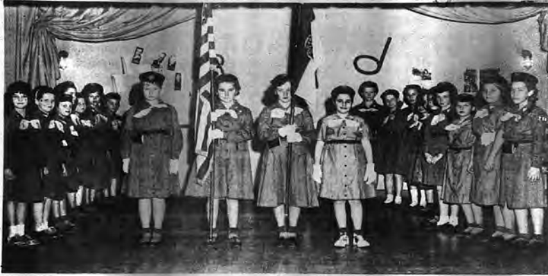
FLAG CEREMONY AND AMATEUR SHOW STAGED

IN OBSERVANCE of Girl Scout Week at Old Country Rd. School, Hicksville, a flag ceremony and amateur show was presented by Troop 284 for parents and