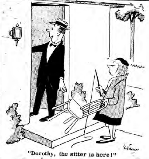
"Dorothy, the sitter is here!"