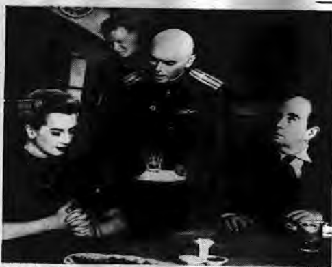
DEBORAH KERR , as an Englishwoman whose attempt to reach the safety of Austria from revolt - torn Budapest is held up by the Russian officer, Yul Brynner, refuses his offer of a drink in this scene from "The Journey" now playing at Century's Shore Theatre in Huntington. Robert Morely (at right) observes the incident. The suspenseful drama was filmed entirely on location in Austria.