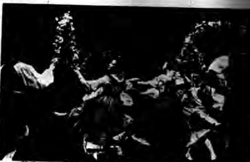
MERRY-GO-ROUNDERS, professional dance group, will present three ballets this Saturday, Jan. 31, at Syosset High in a program sponsored by the P-TA Jr. Programs of Syosset. The dancers are shown in the Tryolean Wedding number. Performances are scheduled for 10:30 A.M. and 1:30 P.M. The admission price is $1 for the two remaining programs in a current series, bringing live professional theatre to children of the School District.

You say you can't dance. That's OK too. Cause this orchestra will sing for you and entertain you in the comfort of a chair which will be provided for you (if you arrive early) on the dancing perimeter. This social is earmarked for a FOUR STAR HIT.