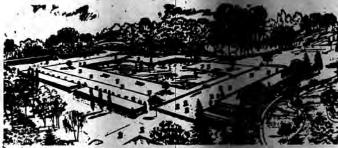
The Woodbury Country Club will provide year-round family recreation in an 18-acre woodland setting on the former Ogden Mills Estate.