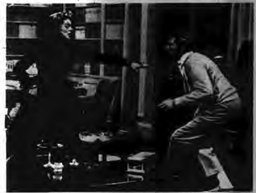
ROSALIND RUSSELL and Robin Hughes in a hilarious comedy sequence from "Auntie Mame" now playing at the Century Shore Theatre in Huntington. Forrest Tucker, Coral Browne and Fred Clark co-star with Miss Russell in the production based on the hit Broadway play and best-selling novel.

Wed. thru Tues., Jan. 28 to Feb. 3 - Cat On A Hot Tin Roof 2:00, 4:00, 5:55, 8:05, 10:10.