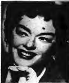
ROSALIND RUSSELL is starring in "Auntie Mame" which starts Sunday, Jan. 25, at the Cove Theatre, Glen Cove.