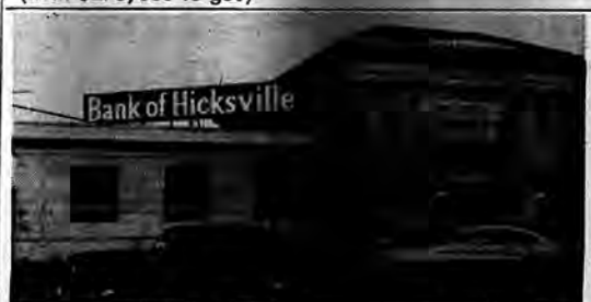
FORMER BANK OF HICKSVILLE building on Broadway at the RR crossing, opposite Herzog Pl., will be acquired by the Town of Oyster Bay for use as an annex of the Oyster Bay Town Hall. The structure, mostly recently the Hicksville office of the Meadow Brook National Bank until their new three-story building was erected, is currently being rented by the Town.

While Hicksville School District on Jan. 1st of this year paid off the last $15,000 on its 1922 High School Site and Construction bond issue of $365,000 it still will be paying off approved bond issues until 1986 -- or 27 years into the future. The District as of Dec. 31, 1958 as $13,188,000 in bonds to pay off. All together there are 19 bond issues remaining, including the 1950 Public Library Site and Building issue of $40,000 (with $8,000 unpaid) and the 1957 Public Library Addition of $312,000 (with $298,000 to go.)