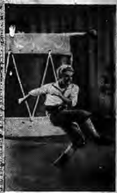
SCENE from "Tom Thumb" the MGM wonderfilm at the Cove Theatre, Glen Cove, on Saturday matinee on Dec. 20 and all day Sunday thru Tuesday, Dec. 21 to 23.

FOUR WEEK LUXURY VACATION to WILBUR CLARK'S DESERT INN, LAS VEGAS plus $1,000 in cash (Total value - $2,500) Flight via UNITED AIR LINES The Radar Line In conjunction with RADIO STATIONS WGLI 1290 on your A.M. Dial WTFM 103.5 on your F.M. Dial "1290 LUCKY NAMES CONTEST" Free entry blanks at all PRUDENTIAL THEATRES GRAND PRIZE AWARDED CHRISTMAS DAY at the ALL-WEATHER DRIVE IN THEATRE SUNRISE HWY. COPIAGUS, L.I.