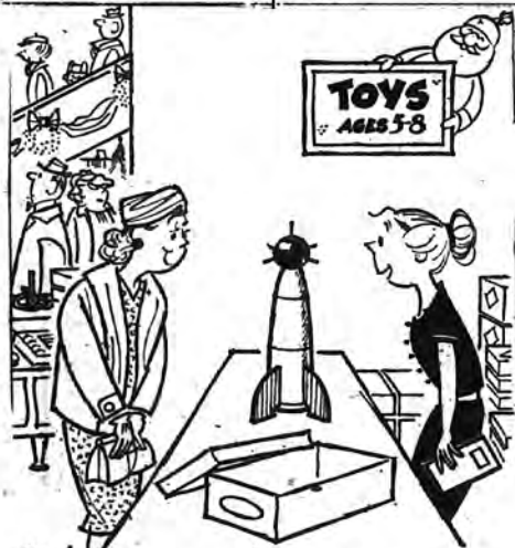
"And the best feature is that satellites are absolutely silent"