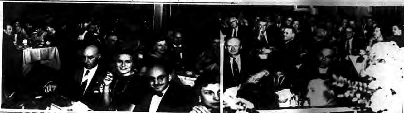
FORA CHANGE we publish these pictures taken at the recent Hicksville Kiwanis Ladies Night at the Milleridge Inn instead of the head table. How many people can you identify?