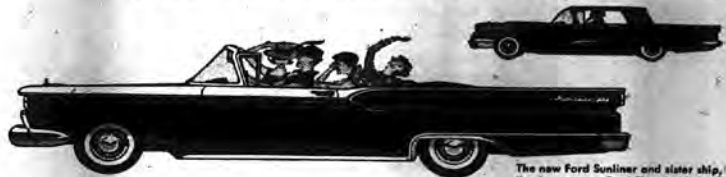
The new Ford Sunliner and sister ship, the 4-passenger Ford Thunderbird.