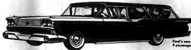
Ford's new 9-passenger Country Sedan