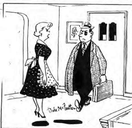
"Dissatisfied customer or new secretary?"