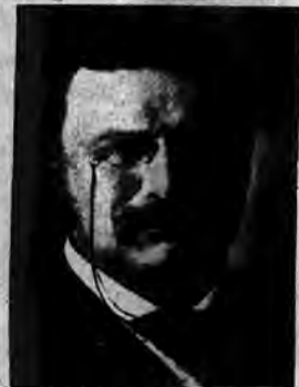
THEODORE ROOSEVELT Our 26th President

During the afternoons of Oct. 25 and 26 able bodied and suitably attired (for climbing ladders) visitors will be ferried in launches from the Oyster Bay Town Dock in Roosevelt Memorial Park in Oyster Bay to the ships and return.