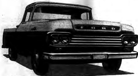
NEW FORD STYLISH! Note the handsome new hood and grille, stronger wrap-around bumper.