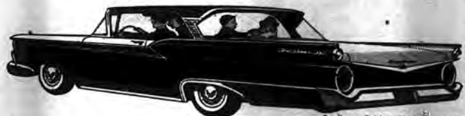
Ford's new Fairlane 500 Club Victoria.