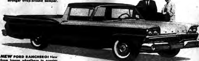
NEW FORD RANCHERO! New from longer wheelbase to greater loadspace!