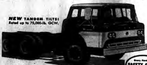
NEW TANDEM TILTS! Rated up to 75,000-lb. GCW.