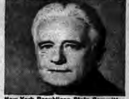
New York Republican State Committee

He is famous in the Capital for his energy, ability and devotion to duty.