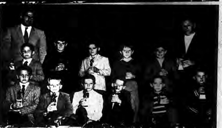
Farm System Champions