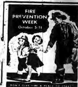
FIRE PREVENTION WEEK October 5-11

Vol. 17 No. 36 HICKSVILLE, L.I. NEW YORK, SEPTEMBER 25, 1958