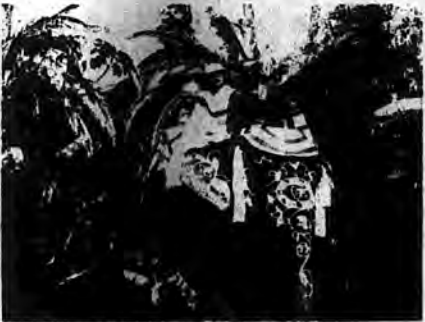
SECOND BIG WEEK for "Around the World in 80 Days" starts at the Cove Theatre in Glen Cove, where the feature is showing at popular road prices thru Aug. 26.