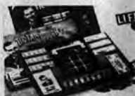
"Tick-Tac Dough" Action packed and fast moving by TRANSGRAM