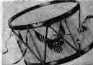
Automatic Play Drum, plays authentic marching rhythm. by EMENEE INDUSTRIES