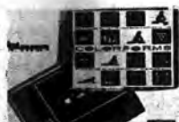
Colorforms. Create with plastic shapes. by COLORFORMS