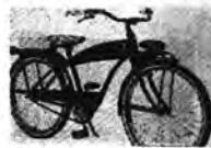
Boys and Girls 28" 2-wheeler bicycles. Sturdily made by STELBER