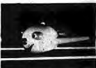
"Little Orby" defies gravity walks on windows, mirrors, walls by TIGRETT