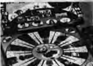
"Around the World in 80 Days" Action packed and fast moving by TRANSGRAM