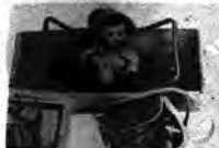
Tiny Tears Doll with car bed. 15" with Rooted Hair. Clothed. by AMERICAN CHARACTER DOLL