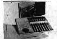
Hassenfeld Pencil Craft. "Pedigree" Color by number set. by HASSENFELD BROS.