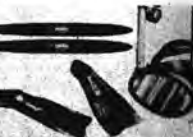
Skin Diving and Water Skiing equipment. Professional-type water skis, face masks with snorkels, swim fins. by HEALTHWAYS