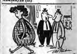
"Understand the new style was designed by a drunken tent maker that hated women!"

Attorneys for Plaintiff Office and Post Office Address 401 Broadway New York 13, New York A245x6/28 (6)