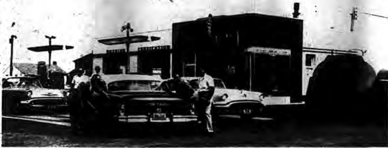
KIWANIS GASORAMA at Ferrara's Sunoco Service Station on W. John St., Hicksville, held last week resulted in more than 4,000 gallons of gasoline being pumped by