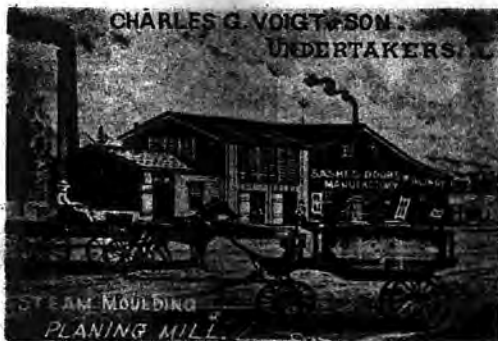
ANCIENT ADVERTISEMENT OF the Voigt planning mill combined with an undertaking business, which was circulated at the time of Hicksville's Tercentennial celebration in 1948.