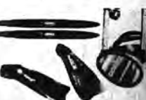
Skin Diving and Water Skiing equipment. Professional-type water skis, face masks with snorkels, swim fins. by HEALTHWAYS