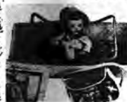
Tiny Tears Doll with car bed. 16" with Rooted Hair. Clothed. by AMERICAN CHARACTER DOLL