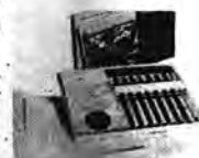
Hamro Pencil Craft. "Pedigree". Color by number set. by HASENFELD BROS.