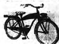
Boys and Girls 28" 2-wheeler bicycles. Sturdily made. by ESKA