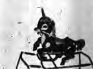
Fantasy Pony. All vinyl spring horse. by BAY SHORE INDUSTRIES