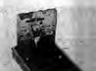
Drop-Kick. The exciting automatic football game. by GOTHAM PRESSED STEEL