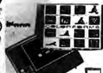
Colorforms. Create with plastic shapes. by COLORFORMS