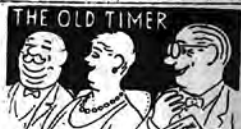
"Middle age is when two of everything is too much—including chins!"

The big feature of the Carnival-Bazaar was the beautiful red and white 1958 Plymouth Station Wagon on display. On closing night, July 6 the car was awarded to Vincent Cuttitta of 6919 - 213th St., Bay-side. This award, made in conjunction with the fair, was one of the greatest contributing factors to its success. In consequence