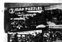
3 Map puzzles of the U.S.A. Fun, educational. A Built-Rite toy. by WARREN PAPER PROD.