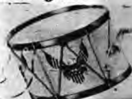
Automatic Play Drum, plays authentic marching rhythm. by EMENEE INDUSTRIES