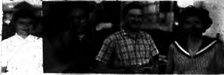
Ignore Weinstein Sam Bicks ORE WEINSTEIN FOREST DRIVE