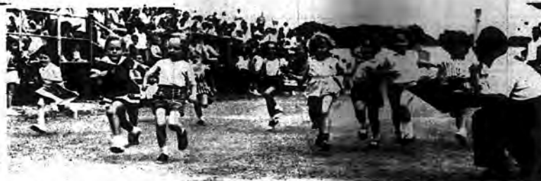
FINISH LINE view of youngsters in the kindergarten-first grade race at Hicksville's first annual Fourth of July Family

On Sale at Bohack Thursday Friday Saturday