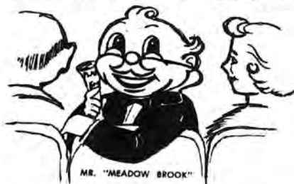
MR. "MEADOW BROOK"