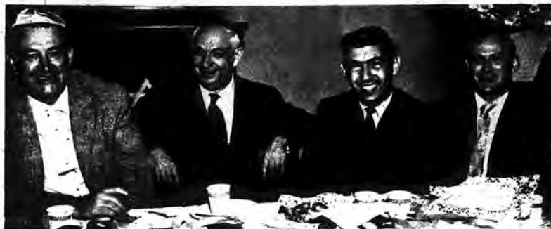
HICKSVILLE JEWISH Centre at Jerusalem Ave and Maglie Drive was dedicated during day-long ceremonies, Sunday, concluding a four-year project. Above, at the right, shows members of the congregation and special guests, including town and county officials, arriving for the ceremonies at the new structure. Attending a