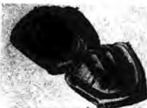
Official fielder's glove and catcher's mitt by Globe, world's finest sporting goods manufacturer.