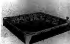
Finest quality 6' wading pool by Muskin Manufacturing Co.