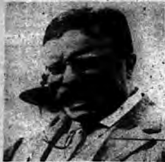
The amiable Mr. Roosevelt

clude: Army, Navy, Air Force, Merchant Marine Academy, American Legion, Veterans of Foreign Wars and other veterans' organizations; about 2000 Boy Scouts, contingents of Girl Scouts, vicinity Fire Departments; a band of Shinnecock Indians from Southampton, British War Veterans; Civil Defense; Red Cross; a number of floats including Grumman Aircraft, Republican Aviation, Nassau County, 4-M Band of Massapequa; Air Cadets of Bethpage, Oyster Bay Republican Recruits, Oyster Bay Republican Club, Lions, Rotary, Kiwanis, Italian-American Society and a special float sponsored by the descendants of the Cove School which "TR" attended.