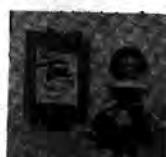
New exciting 10 1/2" Toni Doll by American Miniature Co.