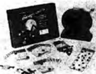
Automatic dispenser Bingomatic Game by Transgram Toy Co.