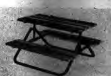
Folding play tables and double benches by Blazen, Inc.