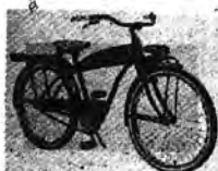
Fully-equipped super-deluxe 26" boy's bicycle.

2. Come to the scheduled Bids For Kids auctions and use your tokens to bid for the things you want most... every item goes to the highest bidder in a real life thrilling auction.