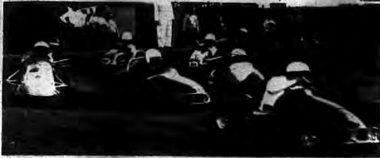
ONE QUARTER MIDGET auto racing 30 mph. Time trials start at 4 PM and takes place every Sunday and holiday at Hempstead Tpke Drive in Theatre and the tiny motor-driven mites hit speeds up to midget Assoc begin at 6 PM.