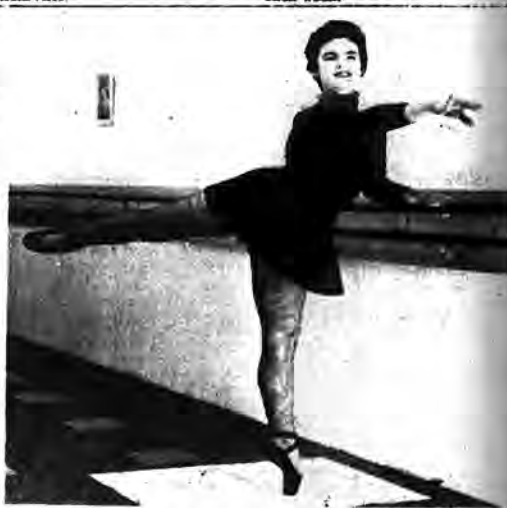
PEGGY O'CONNOR School of Dance presents its Seventh Annual Dance Variety Show on June 27 and 28 in the Hicksville High School Auditorium at 8 P.M. for the benefit of the Scholarship Fund. The donation is 75 cents.