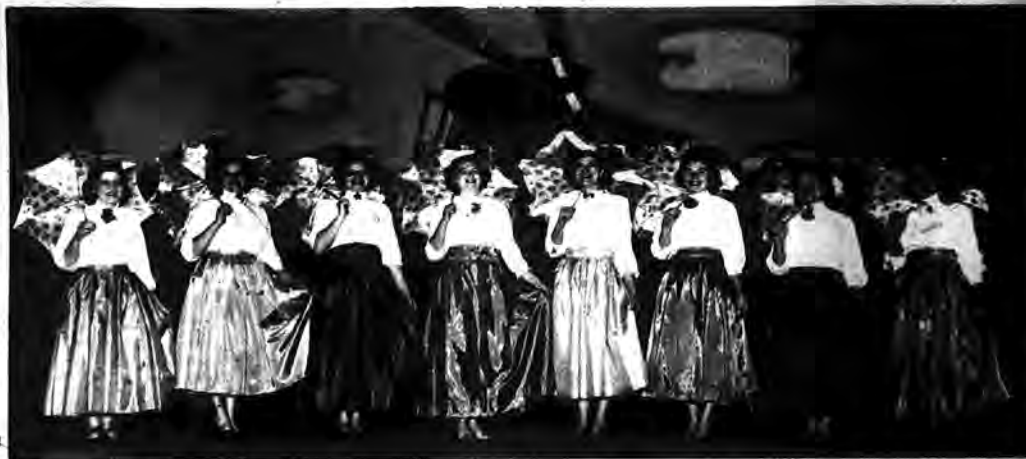
FLORA-DORA GIRLS going thru their routine at the Gay Nineties Show staged for members of St. Ignatius Loyola Auxiliary of Christian Mothers at their final meeting of the season Monday night, June 16. Left to right, the