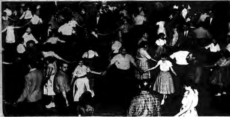
SQUARE DANCING for Girl Scouts and their fathers, held Thursday night at the Jerusalem Ave Jr High School in Hicksville, proved to be another successful af-

fair. First scheduled dance this year was cancelled by inclement weather.