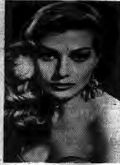
ANITA EKBERG, the sexsation from Sweden, is starred with Bob Hope, Fernandel and Martha Hyer in the laugh hit, "Paris Holiday" at the Cove Theatre, Glen Cove, now thru Saturday, May 24.

The awards committee of the Bethpage Garden Club will tour various areas of Bethpage each month and rate outstanding homes.