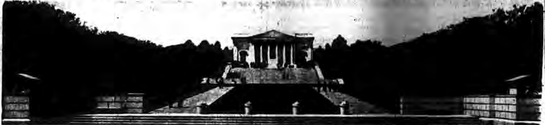
HIGH ON THE STEPS LEADING TO THE ARLINGTON MEMORIAL AMPHITHEATER RESTS THE UNKNOWN SOLDIER

For the Seniors it was a most unusual trip which included living aboard a steamer chartered entirely by the Class as they sailed from Baltimore on a 12-hour voyage to Norfolk, Va. There were stops at Norfolk, Williamsburg, Annapolis, Arlington, Jamestown and Yorktown. They also made tours of Washington by bus and returned to Hicksville by train, arriving at the local station at 11:30 PM Sunday.