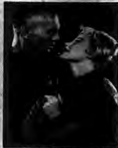
YUL BRYNNER and Maria Schell enact the passionate lovers in the filmization of Dostoyevsky's great novel "The Brothers Karamazov" at the Cove Theatre, Glen Cove, now thru April 1.

The organizational meeting of the Mid-Island Lodge #206, Free Sons of Israel, was held at the V.F.W. Hall, 580 Newbridge Ave., East Meadow on March 18 at 8:30 P.M. This meeting was the last in a series held prior to the issuance of a charter from the Grand Lodge. This event will take place at the East Meadow Jewish Center, 1400 Prospect Ave., East Meadow on Tuesday evening.