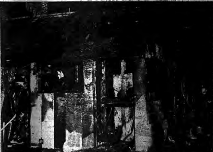
which may have resulted from the fire reaching the gasoline tank of a power mower, caused an explosion which wrecked the side of the dwelling. During the past week the volunteers under Chief Medard Offenbach answered 7 alarms including a false alarm on Monday when a faulty sprinkler is believed to have