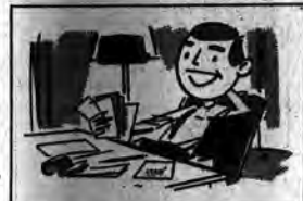
We paid current bills and taxes.