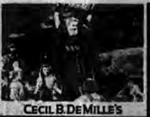
CECIL B. DEMILLE'S