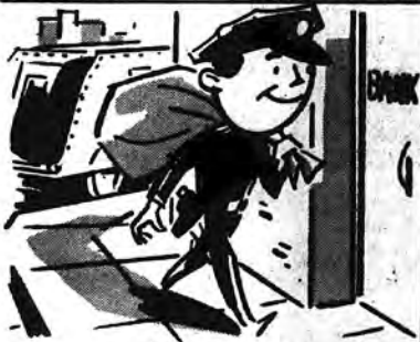
5. Sorted checks are delivered to the banks on which they are drawn by 8:00 A.M.