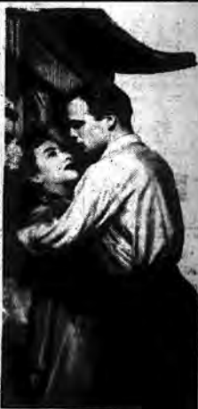
MARLON BRANDO and Miko Taka in "Sayonara" playing now thru Tuesday at the Cove Theatre, Glen Cove.

Sun-Tues. 2/2-4 Don't Go Near The Water 1:30, 3:30, 5:25, 7:30, 9:30.