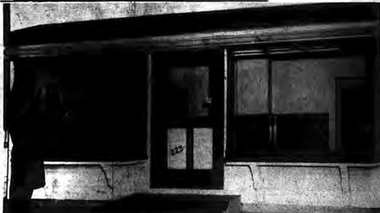
NEW ADDRESS for the Mid Island Herald and Plainview Herald is at 225 Broadway, just south of the corner of Old Country Road in Hicksville. Moving operations are taking place

over the weekend. Need for increased space resulted in the move.