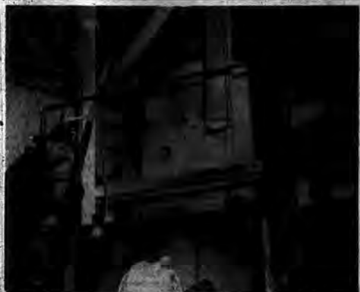
BUCKET BRIGADE of firemen handing up G-1 powder to smolder high temperature magnesium fire included Charles Ellinger on ladder. See story below.

Vol. 11 No. 2-Hicksville, N. Y., - January 30, 1958 5c Entered as Second-Class Matter at Hicksville, N. Y., Post Office.