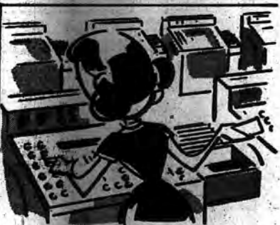
4. About 100,000 checks are sorted each night. Credits and debits are posted for each bank.