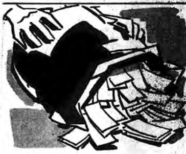
3. Check arrives at Clearing House with thousands of others from all parts of County.