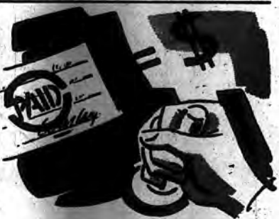
6. The check Sam deposited, having been collected, becomes ready cash.