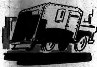
2. Check is taken to Clearing House by armored truck.