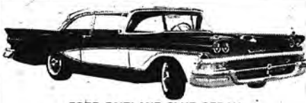
FORD FAIRLANE CLUB SEDAN