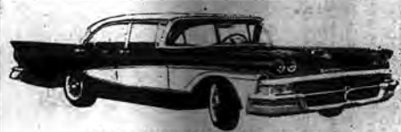
FORD FAIRLANE TOWN SEDAN