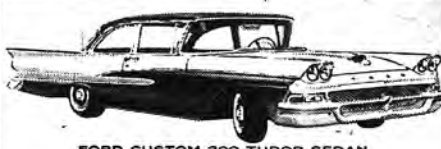
FORD CUSTOM 300 TUDOR SEDAN