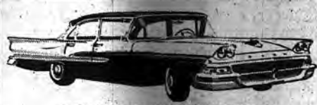
FORD CUSTOM 300 FORDOR SEDAN