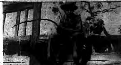
NEW DISNEY DISCOVERIES ...Tommy Kirk and Spike share many exciting adventures in Walt Disney's "Old Yeller", an action-packed Technicolor feature story of a rough-and-ready range dog pitches in to help a Texas frontier family. It is showing at the C. Theatre, Glen Cove, now thru Saturday, Jan. 25.

— FREE ADMISSION — Present this ad with one (1) adult admission any matinee, then this Fri. up until 6 p.m. and your friend will be admitted free!