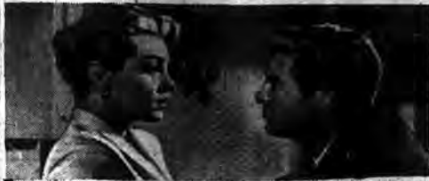
LANA TURNER rebuffs the advances of Lee Phillips in one of the many dramatic moments of "Payton Place" now showing at Century's Shore Theatre in Huntington.