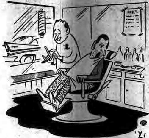
"HOW COME THE FLOOR IS PAINTED RED?"