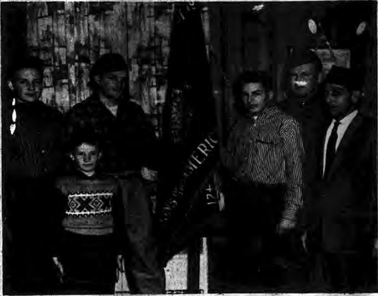
THE REACTIVATION of the Sons of the Legion Squadron of the Charles Wagner Post No. 421, Hicksville, became a reality Friday night at the legion clubhouse. Twenty-eight boys, ranging in age from 3 to 14 years, received their membership cards. At the next meeting, to which all sons of Legion members are invited, election of officers will take place. It is set for