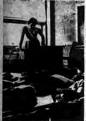
Rest time for the children offers Jane a chance to relax for a moment in her busy day.

The caption on the series of pictures published below was "The question, the concentration and finally the answer -- a graphic illustration of the learning process and its excitement for Jane and her pupil."