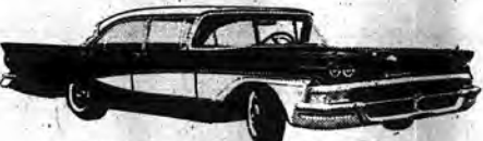
FORD FAIRLANE TOWN SEDAN