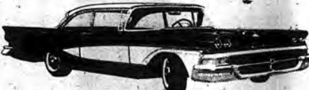
FORD FAIRLANE CLUB SEDAN