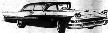
FORD CUSTOM 300 TUDOR SEDAN