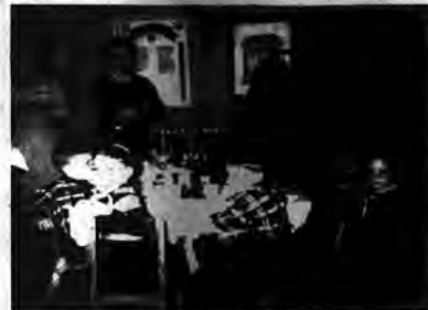
TODDLER GROUP of Congregation Shomrei Zedek, Hicksville recently celebrated Chanukah with a party in the vestry room of the Synagogue, E. Barclay St.