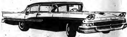
FORD CUSTOM 300 FORDOR SEDAN