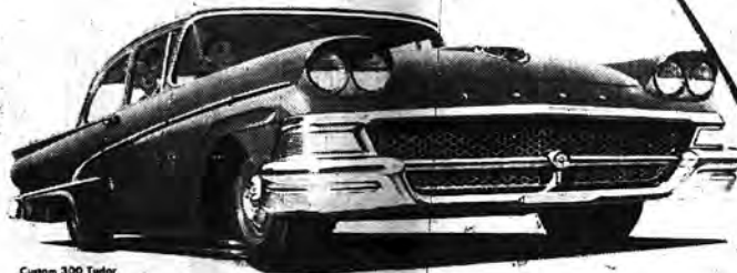
Custom 300 Tudor

SEE HOW YOU CAN SAVE IN '58 Only Ford, in the low-price three, offers you: