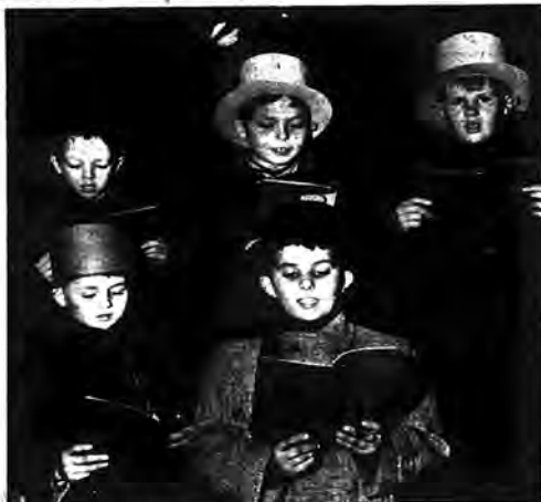
CUBS CAROL AT PLAZA members of Hicksville pack 377, as they sang Christmas Carols at Mid-Island Plaza, Hicksville. The Cubs presented a 20-minute program of Christmas music at the Plaza Dec 20 and 23.

The troops in the neighborhoods of East St. and Woodland Ave. Schools donated three baskets of food to a religious organization to be distributed to needy families.