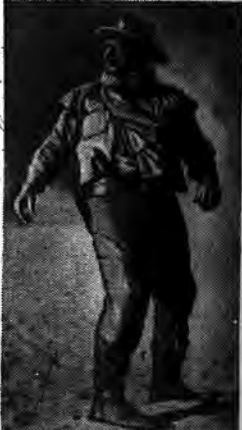
JOHN WAYNE is being buffeted by an approaching sand storm in the Sahara desert. "Legend of the Lost" is showing at the Cove Theatre, Glen Cove, Sunday thru Wednesday, Jan 5 to 8.