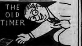
"The best place to look for a helping hand is at the end of your arm."

"Holidays in Many Lands" was the program theme presented at the Robbins Lane PTA meeting held in the Baylis School on Dec. 10. Approximately 300 parents, teachers, and friends were present. In view of the gala evening scheduled PTA business was suspended.