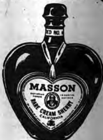
FINE CALIF. WINE