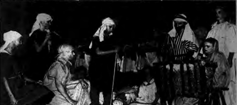
THE BIRTH OF CHRIST, a Christmas story, was presented for over 600 parents and friends of Trinity Lutheran School in Hicksville on Dec. 18. This is one of the scenes from the presentation pageant, which featured students of the school and the mixed choir of Trinity Lutheran Church. The cast and choir numbered 175, combining music and drama.