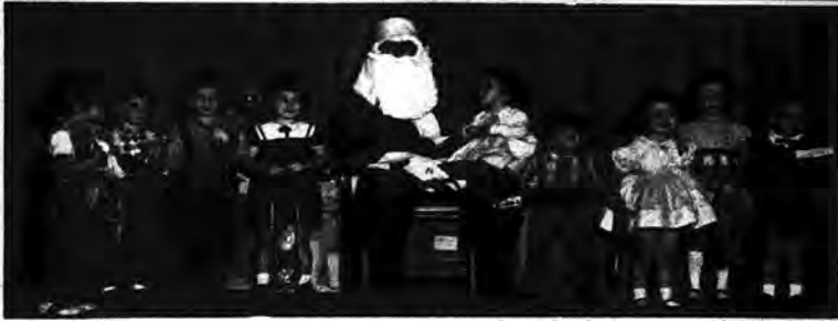
CHILDRENS' ANNUAL Christmas Party of the Northwest Civic Assoc. Inc., of Hicksville was held in the Gymnasium of the Burns Ave School on Saturday, Dec 21 from 2 to 5 P.M. Santa Claus presented a toy-filled stocking to every child attending from the ages of 1 year to 12. There

were approximately 350 children present. Door prizes were awarded to ten children, and for the adults there were drawings for three turkeys, two bottles of cheer and a case of imported beer. The Committee wishes to extend their thanks to all who had volunteered in helping to make this party a complete success.