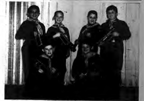
Drum corps may get started shortly. OV 1-1307 and perform your small No excuses boys - it's only 30 minutes per week. Call me at chosen community.

Those who are proficient at playing drums please step forth and volunteer your services so that our