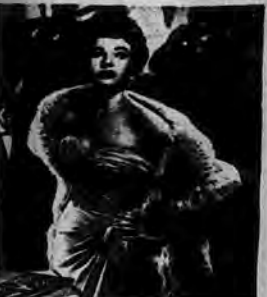
PAL JOEY with Rita Hayworth, Frank Sinatra and Kim Novak is now showing at the Cove Theatre, Glen Cove thru Wednesday, January 1.

Wed.-Sat.-Dec. 25-28 Pal Joey - 2:45, 6:15, 8:20, 10:35; Decision at Sundown 1:30, 4:55. Sat. Mom. Kiddie Show - Dec. 28 2 Cartoons 10:30; Barba Coast Band 10:40; 2 Cartoons 10:50; The Vigilance (Chap. #2) 11:00; HIAWATHA 11:20. Sat.-Mon. Dec. 29, 30 Pal Joey - 2:45, 6:15, 8:20, 10:35; Decision at Sundown - 1:30 and 4:55. Tues. Morn. Dec. 31 8 Disney Cartoons - 10:30; ZIPPY on stage - 11:20; 7 Cartoons 11:50. Tues. (New Year's Eve) Dec. 31 Pal Joey 1:45, 5:35, 7:50, 10:05 Decision at Sundown 4:15 Wed. Jan. 1 Pal Joey 2:45, 6:15, 8:20, 10:35; Decision at Sundown 1:30-4:55.