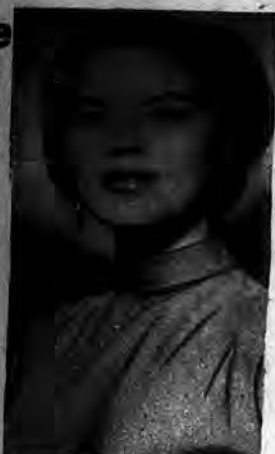
AVA GARDNER is co-starred with Tyronne Powers in "The Sun Also Rises" at the Cove Theatre, Glen Cove, now thru Monday, Sept. 16.