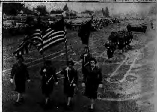
HICKSVILLE FIRE Ladies Auxiliary as they come under the judging arch at the Labor Day Firemen's Parade, Sept. 2. The Hicksville ladies last month won a trophy for appearance in the State Firemen's Convention and Drill at Elmira, N.Y.

NURSERY SCHOOL and KINDERGARTEN Chartered by the N.Y. State Board of Regents Experienced State Certified Teachers Transportation - Right outside of Plainview MYrtle 2 - 6361