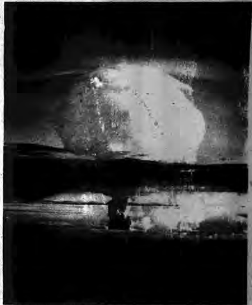
HYDROGEN BOMB , dropped by aircraft of Hypothetica, as it appeared from photo plane flying over Suffolk County, 50 miles from Ground Zero. This photo was taken from a height of 12,000 feet. Two minutes after the bomb went off, the cloud rose to 40,000 feet --- the height of 32 Empire State Buildings. Ten minutes later as it neared its maximum, the cloud had pushed upward about 25 miles, deep into the stratosphere. The mushroom portion went up to ten miles and spread out for 100 miles. Due to the prevailing winds from the North, the Hicksville area is in no immediate danger from fallout.

It is expected that the heavy bombing to which Hypothetica has been subjected will reduce the country's will to fight to zero, and that as we step up our retaliatory raids, the Hypotheticians will request an Armistice which will be followed by Peace throughout this freedom loving world.