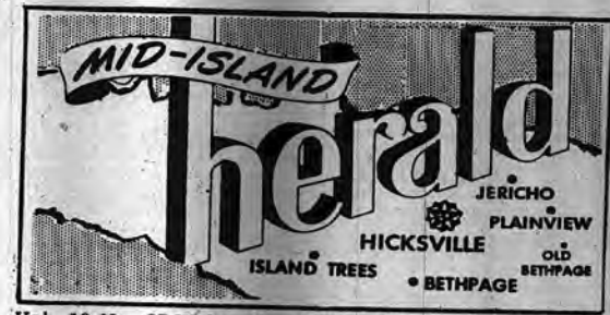
Vol. 10 No. 27 Hicksville, N. Y., July 25, 1957-Copy 5¢