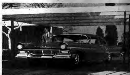
Custom Tudor Sedan

Station wagon minded? Ford has 5 to choose from (including the 9-passenger Country Squire, above). Like all '57 Fords, they're fine cars in every sense of the word. Yet, they're yours for half the fine-car price!