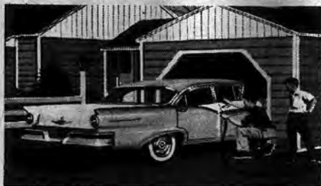
Fairlane 500 Town Sedan

*Based on manufacturers' suggested retail delivered prices