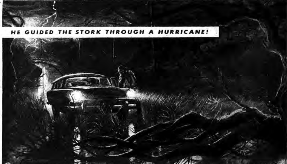
HE GUIDED THE STORK THROUGH A HURRICANE!

The three-person "Camavan" team of the International Walker League will be at Trinity Lutheran Church Hicksville, July 30 to Aug 2.