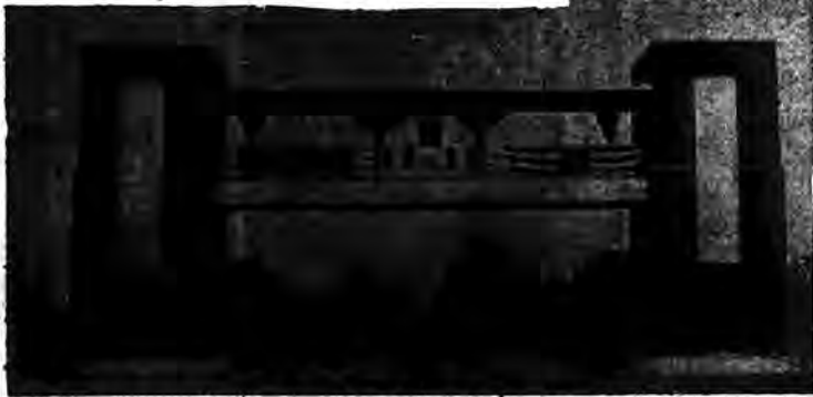
A $10,000 ARCH -- Above arch and training course will be the scene of the July 4th tournament which will be staged by the Hempstead Volunteer Fire Department, located on Weir Street, in the Village of Hempstead.

A solemn dedication to the founding principals of this great Republic on this Independence Day, 1957, can light the way to