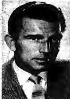
MICHAEL RENNIE as "Carson", the suspected philanderer in "Island in the Sun" showing at the Cove Theatre, Glen Cove, now thru Monday, July 8.