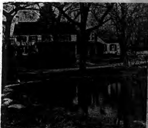
JERICHO SPRING POND with a historic post reaching back to Colonial, pre-Revolutionary days, with the present-day Milleridge Inn in the background as it looked before several additions were made to the building. The ancient, spring-fed pond is scheduled to be filled in by the State as part of the road improvement on Hicksville-Jericho Rd. at the intersection with Jericho Tpke. (Picture taken in 1948)