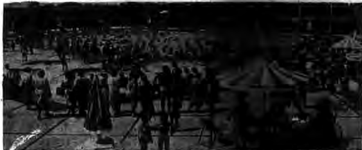
GARDEN CITY this summer has its own community swimming pool and more than 9,000 adults and children were present for the opening day, as shown in this picture. Construction of a pool for the Hicksville Park and Parking District on

As far as we can determine, the reported new purchasers of the Press Wireless property do not expect to get started on their plans for home building until the first of the new year. Now is the time to act and the leadership should logically come from our civic organizations.