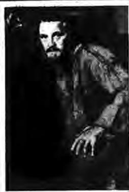
KIRK DOUGLAS as the tormented and emotionally unstable painter Vincent Van Gogh during a tense scene from "Lust For Life" at the Cove Theatre, Glen Cove, Sunday thru Tuesday, June 23 to 25.