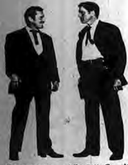
"GUNFIGHT" at the O.K. Corral is shown at the Cove Theatre, Glen Cove, now through Monday, June 17.

Fear Strikes Out 2:00, 5:27, 9:03. Funny Face 3:40, 7:07, 10:43. Sat., June 15. Fear Strikes Out 2:24, 6:10, 10:00. Funny Face 4:04, 7:50, 11:40. Sun., Mon., June 16, 17. Fear Strikes Out 2:00, 5:27, 9:03. Funny Face 3:40, 7:07, 10:43. Tues. thru Thurs., June 18 to 20. Winchester 73, 2:00, 5:20, 8:40. Abandon Ship, 3:31, 6:51, 10:11. GLEN COVE Now to June 17. Gunfight At The O.K. Corral, 2:15 4:55 7:35 10:15. Tues., Wed., Thurs., - June 18, 19, 20 Face In The Crowd, 2:50, 6:30, 10:10.