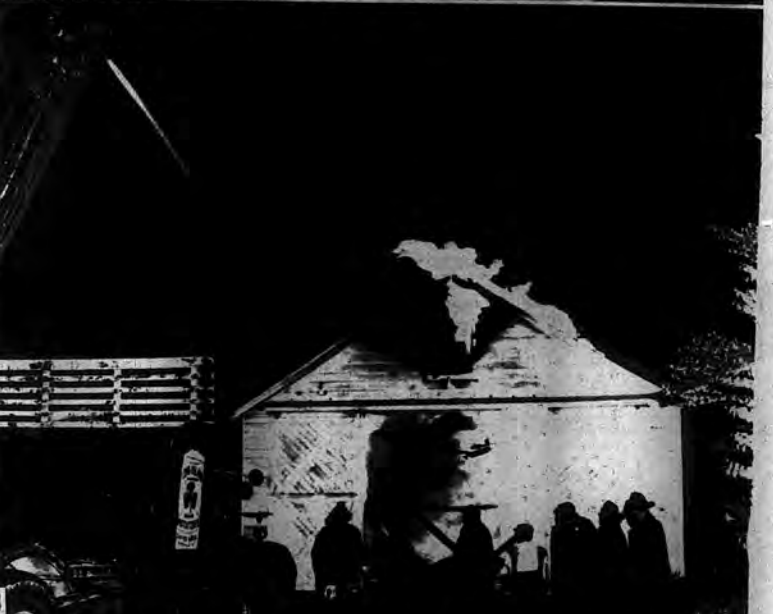
SHATTERING LIGHTNING BOLT struck the Dwyer barn off Newbridge Rd, next to the West Village Green, shortly after midnight last Thursday and set fire to the roof. (1) Shows the building shortly after the Hicksville firemen arrived on the scene with flames already breaking out of the roof at three points. (2) Three farm trucks stored in the barn were backed out to safety