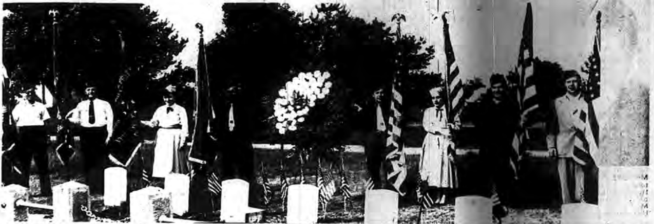
MEMORIAL SERVICES honoring all Hicksville veterans were held Sunday at Plainlawn Cemetery in Hicksville with representatives of all veterans organizations present. Graves of veterans were decorated. The Memorial Committee of Hicksville Fire Dept on Sunday visited the graves of department members in Nassau and Suffolk.