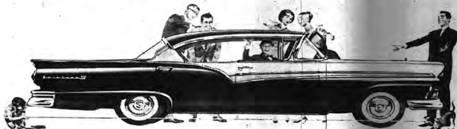
Fairlane 500 Town Victoria