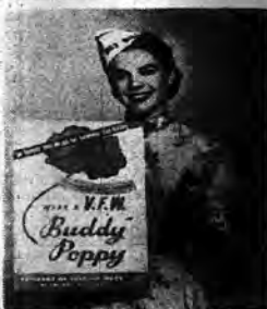
Natalie Wood, Warner Bros. Star, 1957 Buddy Poppy Girl.