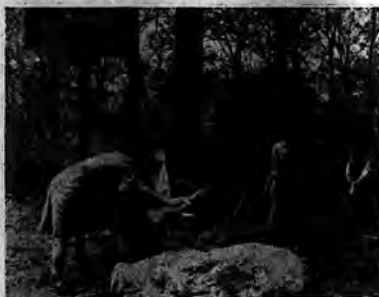
Following a colonial custom, Boy and Girl Scouts with their leaders paced the boundaries of the Robert Williams purchase area during the 300th anniversary celebration. They started at Cantigue Rock.

Cantigue Rock was also the site of the purchase of present day Hicksville and vicinity from the Indians by Robert Williams in 1648.