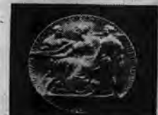
The Vail Medal is the highest telephone honor employees can receive. It is given only for outstanding acts of initiative or courage performed in connection with telephone work, or in which telephone training is an important factor.