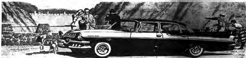
Here's sports car lowness with sports car handling. You sweep along in a "Realm of Silence," master curves with race-car torsion bars. Up to 310 hp. V-8.

Swept-Wing sweeps country! Orders doubled on '57 Dodge!