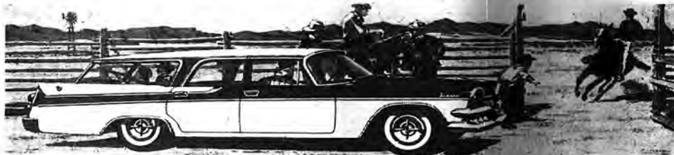
First new idea in station wagons in years—the "Observation Lounge!" The third seat of this Custom Sierra faces the rear, and passengers board at rear, also.