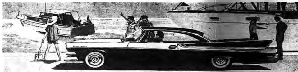
This is the Custom Royal Lancer 2-Door, one of 6 dashing Dodge hardtops. You'd feel like a king (or queen) in any one of them.