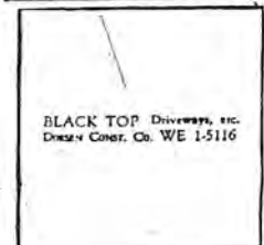
BLACK TOP Driveways, Inc. Direct Contr. Co. WE 5-1116