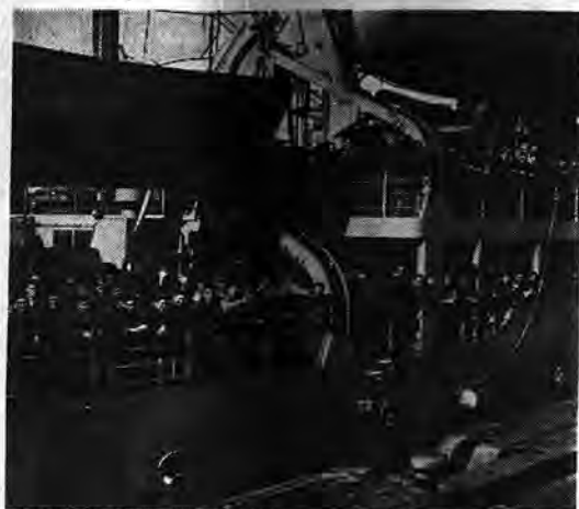
ADIOS AND WIE GEHTS —The Panama Canal, not usually sighted by German-bound troops, carries its largest shipment of soldiers since Korea. This "packet" of 2200 was trained at Fort Ord, Calif., to replace men of the Tenth Infantry Division. Their embarkation from lighters was a novel offshore loading test.

SHORE, HUNTINGTON Thurs., 3/7: Girl Can't Help It 1:00, 3:45, 6:30, 9:30; Storm Rider 2:30, 5:20, 8:10. Fri., Sat., 3/8-9: Storm Rider 1:00, 3:45, 6:35, 9:30; Girl Can't Help It 2:10, 5:00, 7:50, 10:40. Sun. thru Tues., 3/10-12: Girl Can't Help It 1:00, 3:45, 6:30; Storm Rider 2:30, 5:20, 8:10. HUNTINGTON THEATRE Thurs., 3/7: Night Runner 1:05, 4:30, 7:50; Battle Hymn 2:30, 5:50, 9:20. Fri., Sat., 3/8-9: Battle Hymn 1:00, 3:45, 6:35, 9:30; Night Runner 2:45, 6:00, 9:15. Sun. thru Tues., 3/10-12: Night Runner 1:05, 4:30, 7:50; Battle Hymn 2:30, 5:50, 9:20. HICKSVILLE THEATRE Fri., 3/8: Istanbul 2:00, 5:24, 8:38; Written on the Wind 3:29, 6:53, 10:17. Sat., 3/9: Written on the Wind 2:00, 5:24, 8:32; Istanbul 3:55, 7:03, 10:27. Sun., 3/10: Written on the Wind 1:00, 4:24, 7:32, 10:30; Istanbul 2:55, 6:03, 9:11. Mon., 3/11: Istanbul 2:00, 5:24, 8:48; Written on the Wind 3:27, 6:53, 10:17. Tues. thru Thurs., 3/12-14: Slander 2:00, 5:22, 8:44; Barretts of Wimpole St. 3:21, 6:43, 10:05. 110 DRIVE-IN (Open Week Ends Only) Fri. thru Sun., 3/8-10: Naked Parade 7:10, 10:10; Flesh and the Spur 8:50. COVE THEATRE Fri., Sat., 3/8-9: Battle Hymn, 3:20, 6:50, 10:35; Night Runner 2:00, 5:35, 9:15.