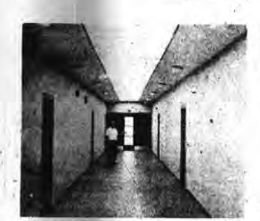
CORRIDOR VIEW of temporary school structure, showing skylight