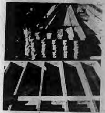
PRECUT and formed ratters and interpretable panels on location