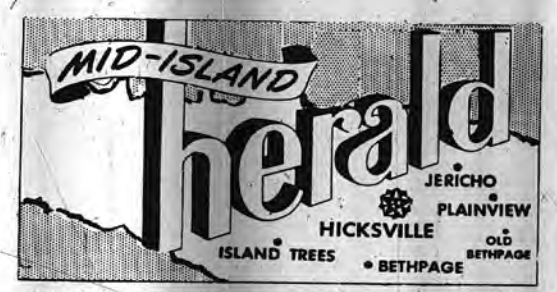
Vol. 10 No. 7 Hicksville, N.Y. February 21, 1957-- Copy 5c tered as Second Class Matter at Hickeville N.Y., Past Office