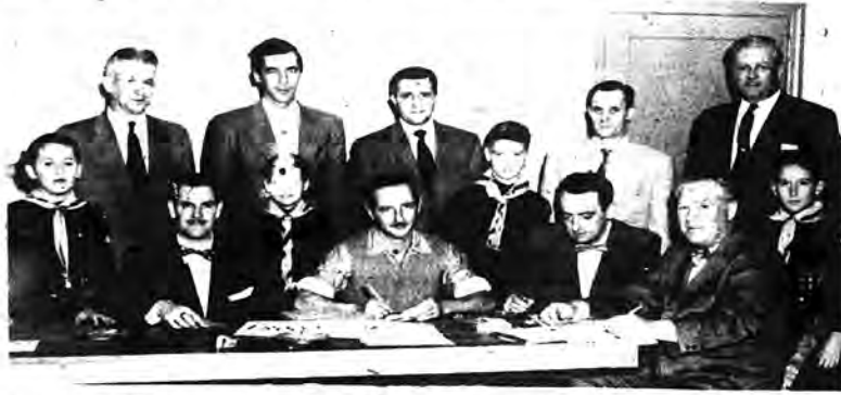
BOY SCOUT FUND workers at one of the several headquarters established during the campaign in Hicksville, Sunday. This scene at the VFW Clubhouse was duplicated at the Legion Hall and Methodist Church where fund workers received their assigned territories.