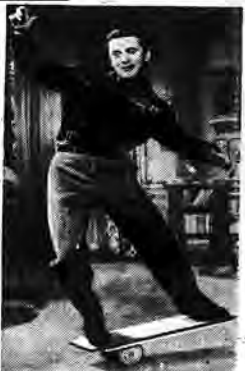
KIRK DOUGLAS in one of his high comedy moments from the comedy-of-the-sexes "Top Secret Affair" at the Cove Theatre, Glen Cove, now thru Saturday, Feb. 16.