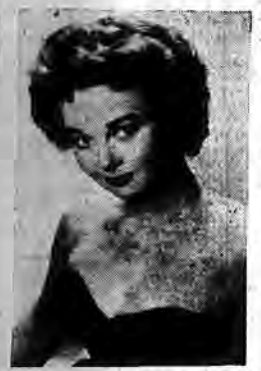
SUSAN HAYWARD co-stars with Kirk Douglas in the amusing screen comedy hit, "Top Secret!", currently showing at Century's Huntington Theatre.