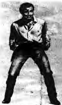
TWO GUNNED Clark Gable as he rules the roost in 'The King and Four Queens', Cinemascope color production at the Cove Theatre, Glen Cove, Sunday thru Tuesday, Feb. 3, 4 and 5.