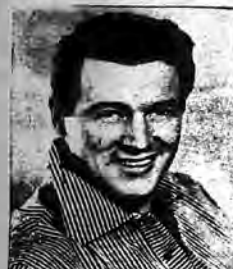
ROCK HUDSON is a high-principled admirer of his best friend's wife in "Written On The Wind," exciting Universal-International Technicolor Drama in which Lauren Bacall, Robert Stack and Dorothy Malone are co-starred with him. The picture is now playing at Century's Huntington Theatre.