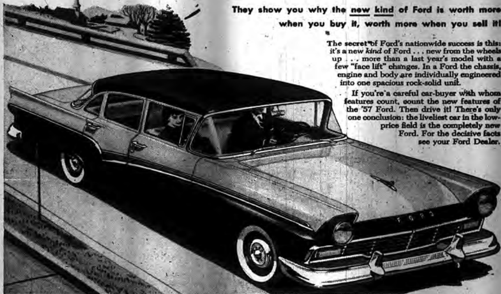
This Custom 300 Fordor Sedan has the Mark of Tomorrow at the low Ford price.

If you're a careful car-buyer with whom features count, count the new features of the '57 Ford. Then drive it! There's only one conclusion: the liveliest car in the low-price field is the completely new Ford. For the decisive facts see your Ford Dealer.