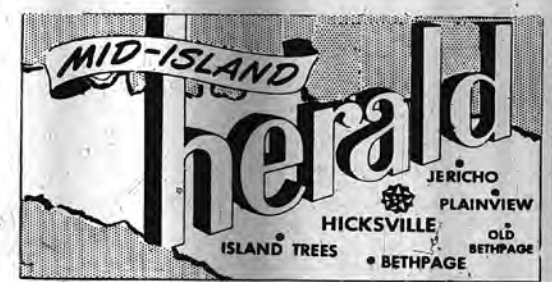
Vol. 10 No. 2 - Hicksville, N.Y. January 17, 1957 - Copy 5c Entered as Second Class Matter at Hicksville N.Y., Post Office