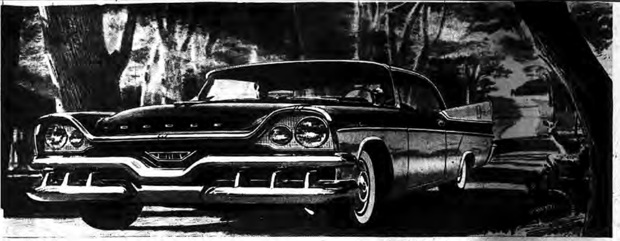
Swept-Wing Dodge . . - only 41/2 feet low and all dynamite

Step into the wonderful world of AUTODYNAMICS