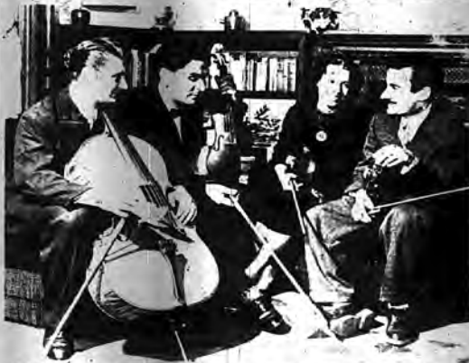
CONCERT WARM-UP —Members, of the Quartetto Italiano are shown in rehearsal for the concert they will present tomorrow (Friday) evening, at the Hicksville High School auditorium on Division Ave. This is the second of three scheduled concerts offered in the current subscription series by the Mid-Island Concert Assoc.