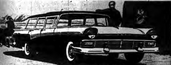
The 8-passenger Country Sedan