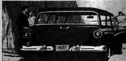
The 6-passenger Country Sedan