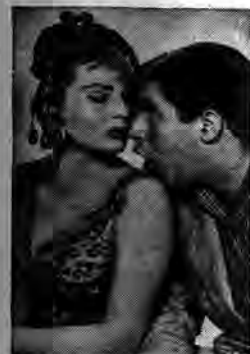
ALONG WITH partner Dean Martin, Jerry Lewis it travels cross-country to meet his idol, Anita Ekberg, face to face in "Hollywood or Bust" now showing at the Cove Theatre, Glen Cove, thru Saturday, Jan. 12.

Thurs., Jan. 10, Hollywood Or Bust, 3:10 - 6:20 - 9:35, Rumble On The Docks, 1:45 - 5:00 - 8:10 Fri., Sat., Jan. 11, 12, Hollywood Or Bust, 3:30 - 12:25, Rumble On The Docks, 2:05 - 5:35 - 9:05. Sat. Morn. Kiddie Show-Jan. 12 2 Cartoons, 10:30-12:25, The Sea Hound(Chapt. #3)10:40, 3 Cartoons 10:55, Duel At Silver Creek 11:20 Sun - Tues., Jan. 13, 14, 15, The Wrong Man, 3:05 - 6:25 - 9:40, Women Of Pitcairn Island, 1:50 - 5:05 - 8:25. Wed., Thurs., Jan. 16, 17, Bundle Of Joy, 3:05 - 6:25 - 9:50, Tension At Table Rock, 1:30 - 4:45 - 8:15.