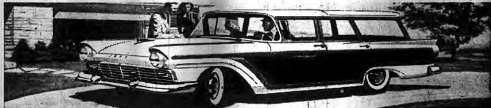
The 8-passenger Country Squire