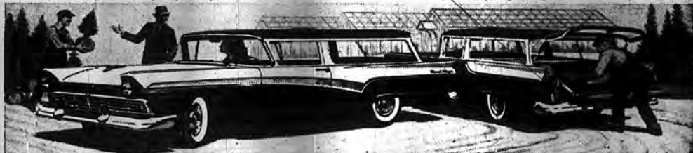
The Del Rio Ranch Wagon