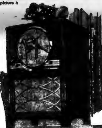
The Zenith WARWICK, Has "Big B" Giant Circle Screen. Bulls Eye Automatic Tuning for all available channels. Zenith-Armstrong FM for superb tone. Period console of genuine Honduras Mahogany veneer.