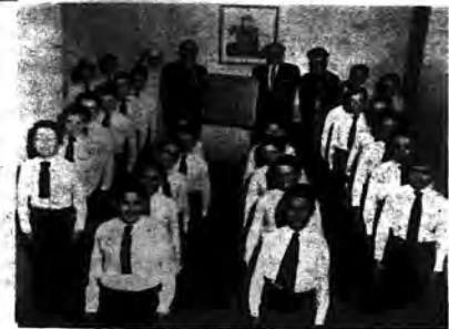
(Left) 7th GRADE GIRLS