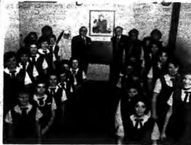
8th GRADE GIRLS (Left)