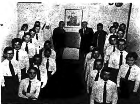
(Right) 7th GRADE BOYS