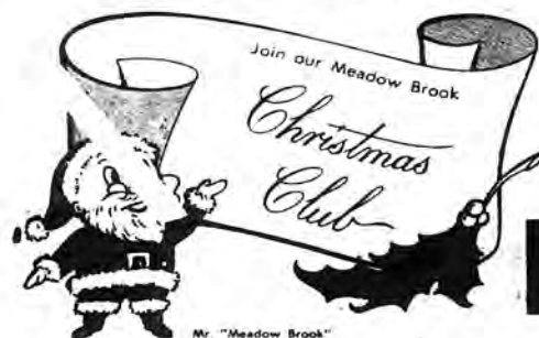
Mr. "Meadow Brook"

START SAVING NOW TO BRING GOOD CHEER - NEXT YEAR