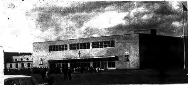
FRONT VIEW of entrance to school and auditorium of the new Holy Family Parochial School, off Newbridge Rd., Hicksville, which was officially dedicated on Oct. 2. Facilities include an auditorium, gymnasium, library and other modern educational. Many parishioners attended the ceremony.

Final arrangements for the Club's annual finance dance, scheduled for Oct. 21