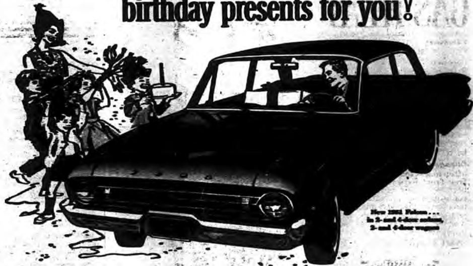
New 1961 Falcon... in 2- and 4-door sedans, 2- and 4-door wagons

You get the presents on the first birthday of the world's most successful new car... up to 30 miles per gallon... 4,000-mile oil changes... a new extended warranty... and much more