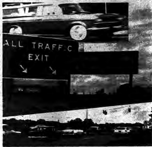
THESE PHOTOS illustrate the problems at Guinea Woods Road at the LI Expressway exit which will shift to Jericho this weekend. Top, car speeding off exit ramp from Expressway. Bottom, Sunday congestion at Guinea Woods Road; Centre, signs of trouble.