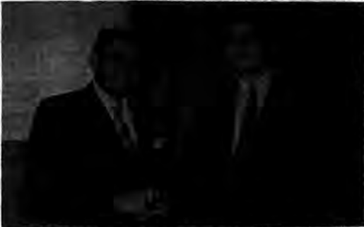
PRODUCER GUY LOMBARDO and Commissioner Robert Moses congratulate each other on joint decision to present an original South Seas spectacle, "Hawaiian Paradise" at Jones Beach Marine Theatre in 1961.